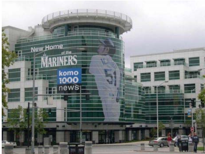
KOMO Plaza, formerly known as Fisher Plaza, houses data center providers and carriers in addition to numerous TV and radio stations.